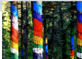
Home to five different world heritage sites