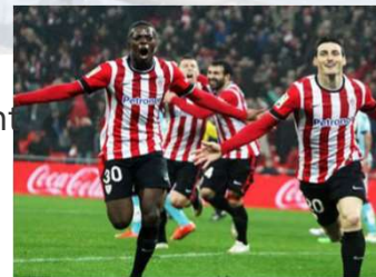
Sports, gastronomy, folklore, festivals...