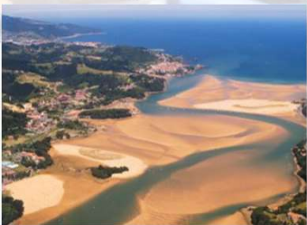
Beach 10 minutes away from city center